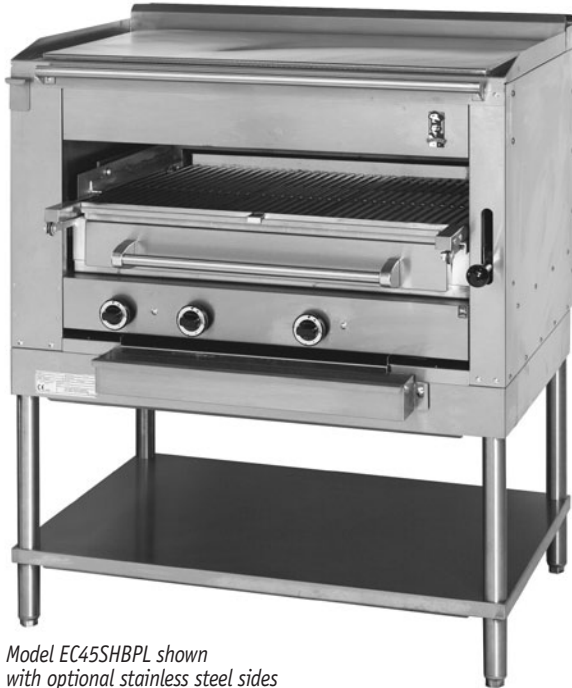
Model EC45SHBPL shown with optional stainless steel sides